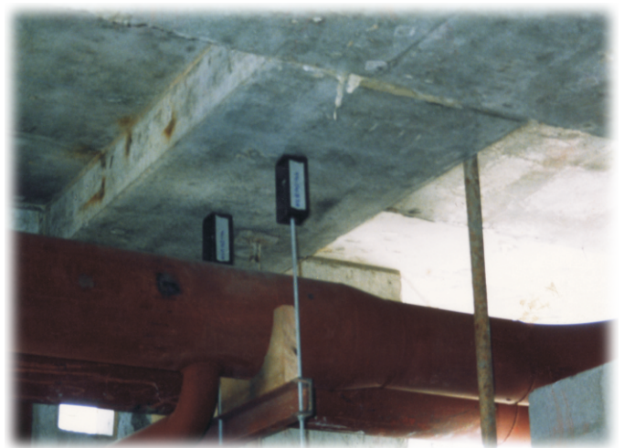
Chiller Pipeline Suspended from Building Ceiling through Spring Hangers ▲

Comprehensive range with load capacity from a few grams to several hundred tonnes.