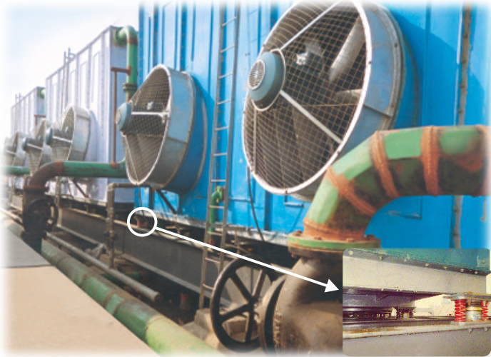
Bank of large Air Handling Units installed of Spring Viscous Dampers of Roof top of Escorts Heart Research Centre ▲